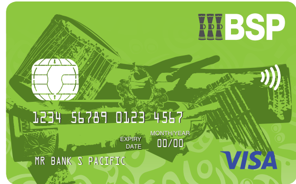
BSP Classic VISA Debit Card*

Move through shopping queues quicker by touching your card to the payment device without the hassle of entering a PIN.