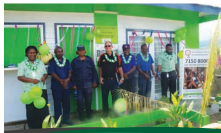
BSP Bulolo construction of Violence against Women office