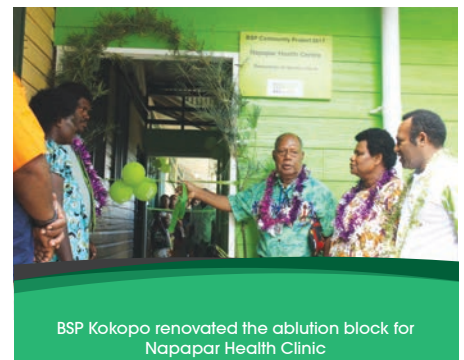
BSP Kokopo renovated the ablution block for Napapar Health Clinic