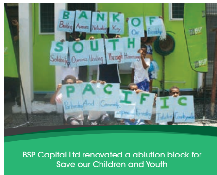
BSP Capital Ltd renovated a ablution block for Save our Children and Youth