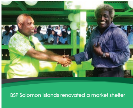
BSP Solomon Islands renovated a market shelter