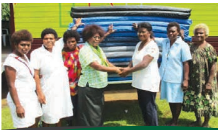
BSP Bialla donated mattresses for Bialla clinic