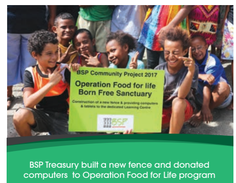
BSP Treasury built a new fence and donated computers to Operation Food for Life program