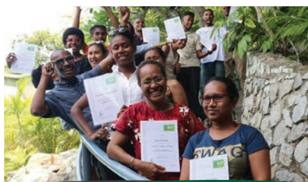
Financial Literacy Training for fashion designers