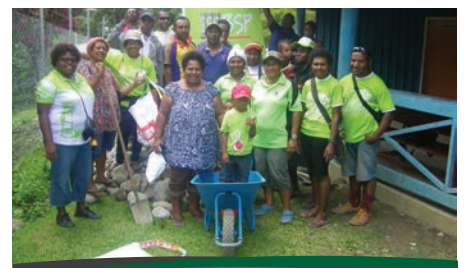
BSP Kundiawa Installation of water tank and pump for Kundiawa Urban Clinic