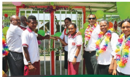
BSP Human Resource built a drinking shed for Hohola Demonstration School