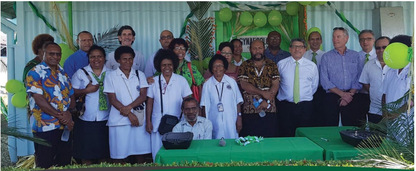
Madang Branch Renovation of the Gynaecology Ward at Modilon General Hospital, Madang Province