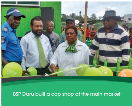
BSP Daru built a cop shop at the main market