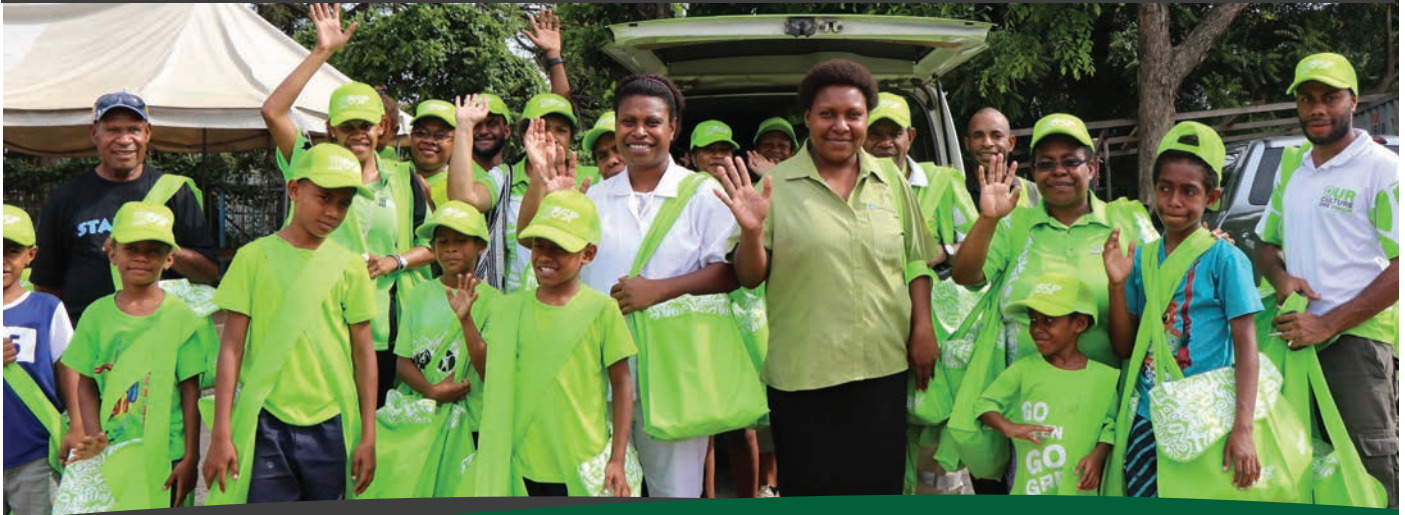
BSP Staff and their families visit to Gerehu Hospital in Port Moresby, prior to christmas

BSP takes great pride in supporting the organisations and worthy causes that are important to our employees and customers throughout PNG and the Pacific. BSP has built strong partnerships with various Organisations, Committees, Events and Charities who champion, cultural unity, environmental sustainability, professional development, sports and health and wellbeing. Through our respected and valuable partnerships, we are able to increase our reach and support to these areas financially. In 2017, BSP as a Group supported to the tune of K6.6 million in sponsorships and donations.