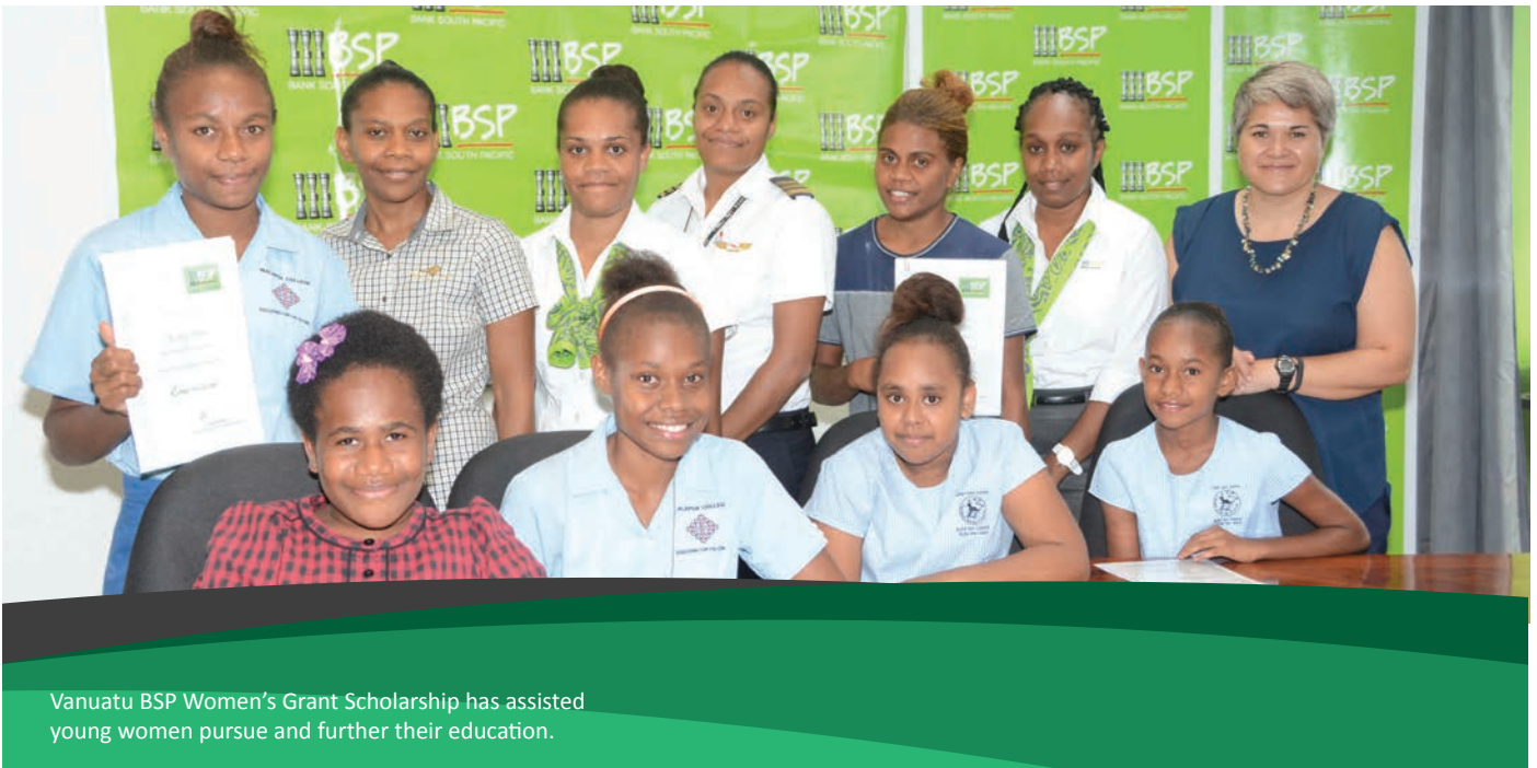
Vanuatu BSP Women's Grant Scholarship has assisted young women pursue and further their education.

Our teams in the Pacific Islands also delivered worthy projects in their communities.