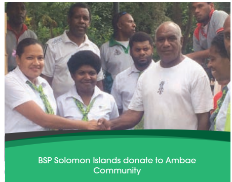
BSP Solomon Islands donate to Ambae Community