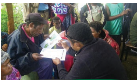
Customers opening account after Financial Literacy Training

BSP educated over 8,378 students in 108 schools throughout PNG.