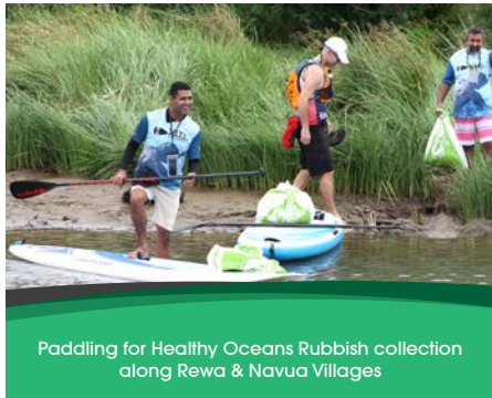
Paddling for Healthy Oceans Rubbish collection along Rewa & Navua Villages