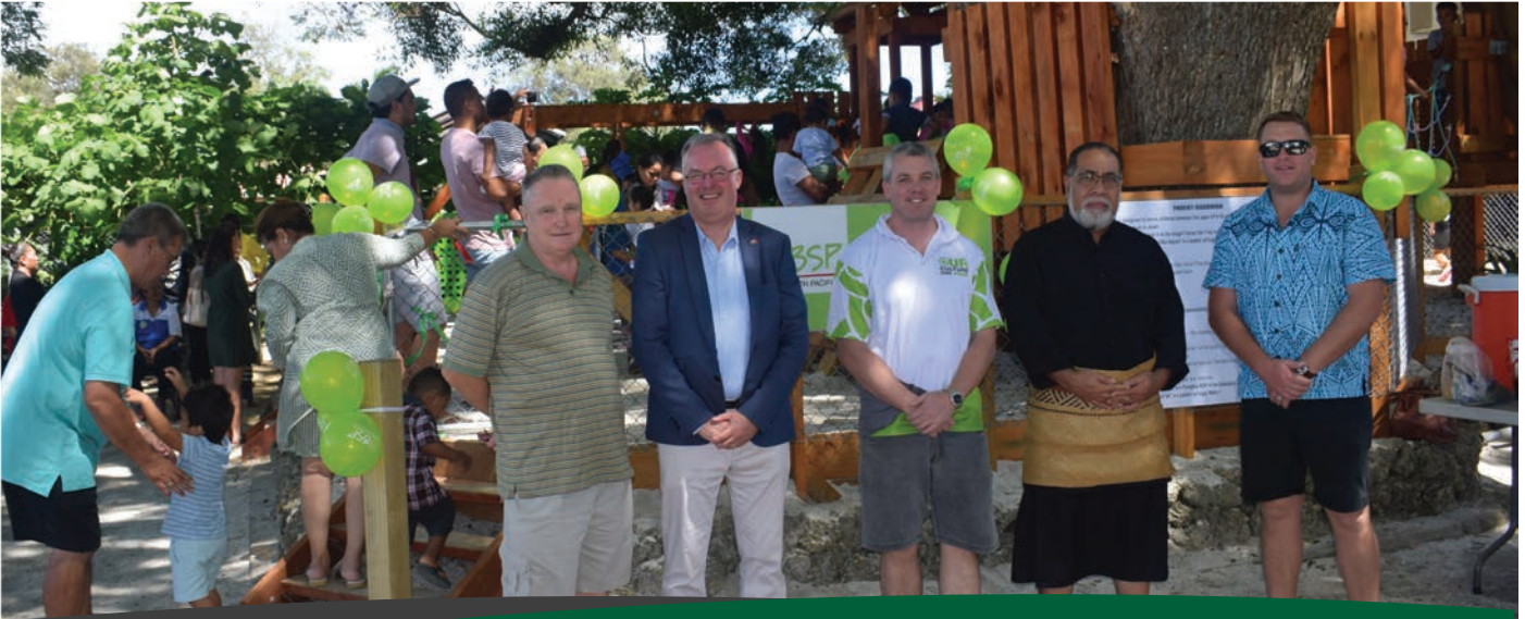
BSP Tonga built a playground at the carpark behind the Branch

We recognise that as a growing Bank in the Pacific, we have a special responsibility to our people, our customer and our community. BSP Community Projects are executed through all our Branches in PNG, Fiji, Solomon Islands, Cook Islands, Samoa, Tonga and Vanuatu. Our staff volunteer their time to assist in the completion of each project. Our Community Project are also undertaken by Strategic Business Units (SBUs).