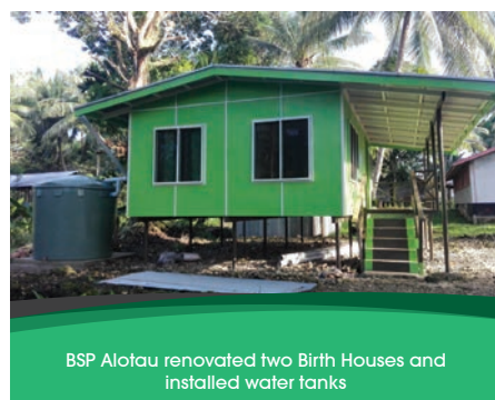
BSP Alotau renovated two Birth Houses and installed water tanks