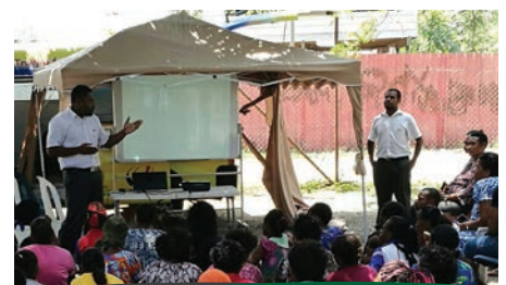
Banking Education Team conducting training