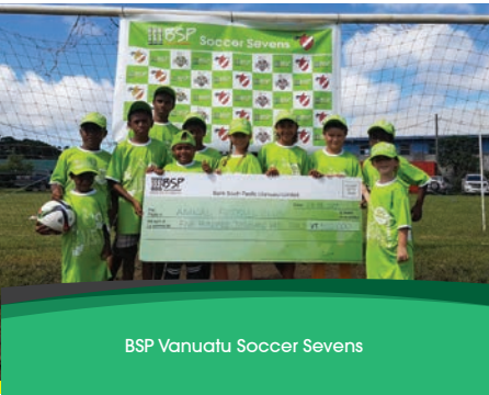
BSP Vanuatu Soccer Sevens