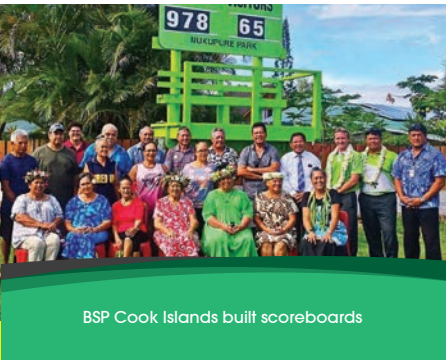
BSP Cook Islands built scoreboards