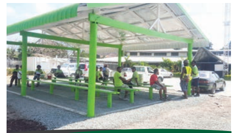
BSP Group Risk Management built a waiting area for patients at Gerehu Hospital