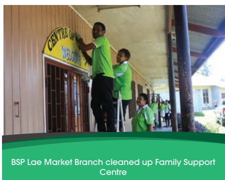
BSP Lae Market Branch cleaned up Family Support Centre