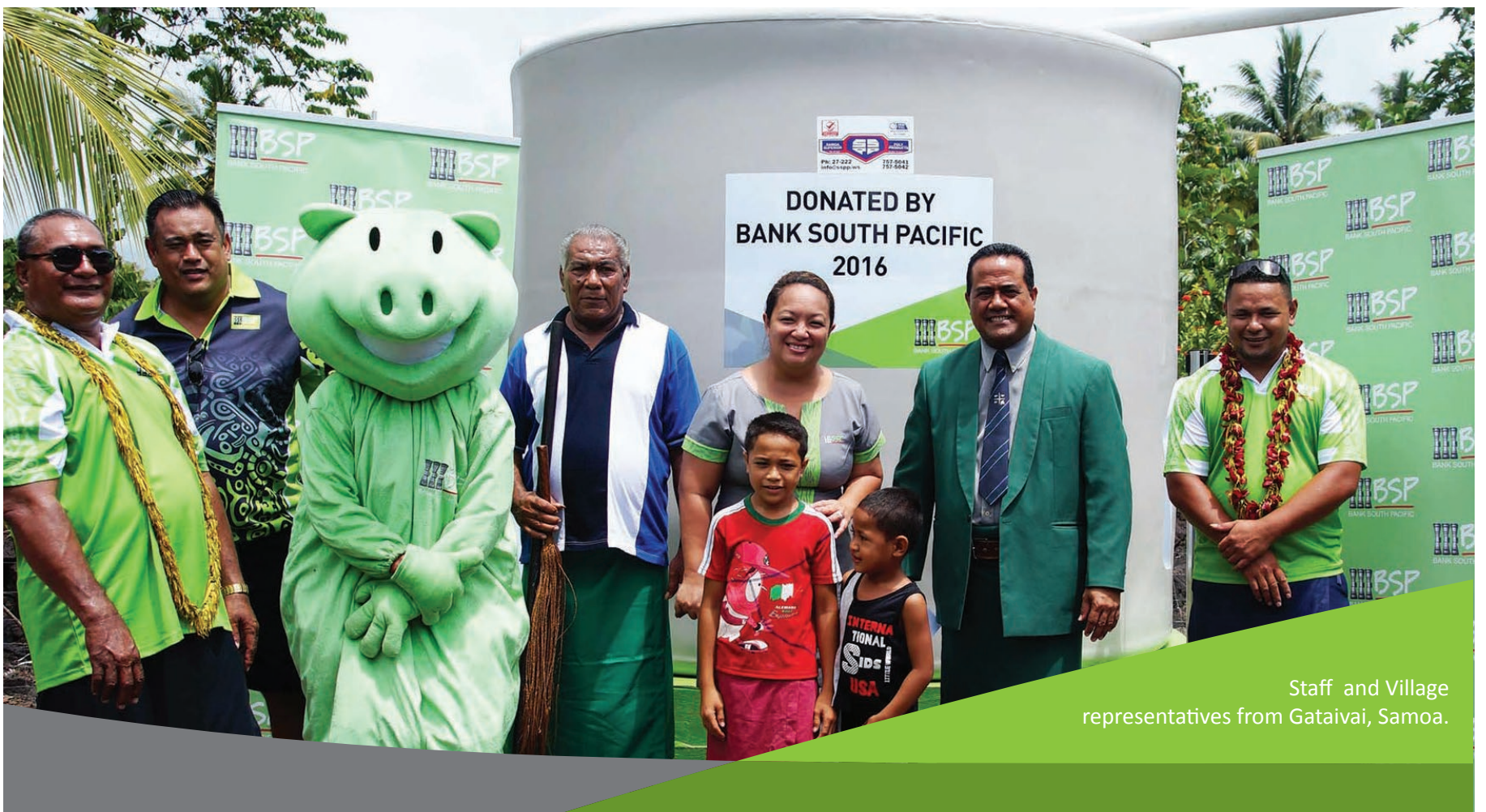
Staff and Village representatives from Gataivai, Samoa.