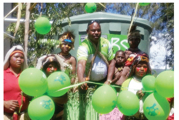
WATER TANK LAUNCH - Tari