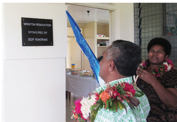
UNVEILING THE PLAQUE - Fiji