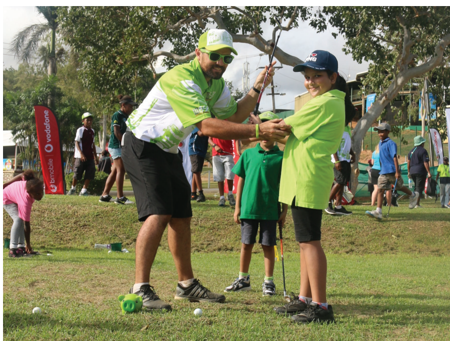
BSP JUNIOR PRO-AM - Port Moresby