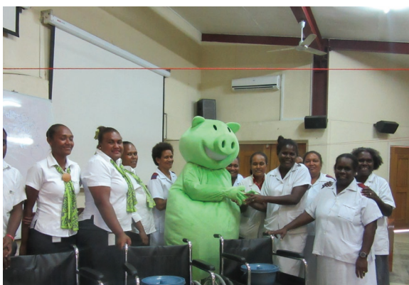
NATIONAL REFERRAL HOSPITAL - Solomon Islands