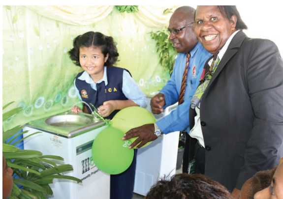
CHRISTIAN ACADEMY - Port Moresby