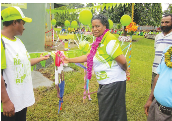
VILELO PRIMARY SCHOOL - Bialla