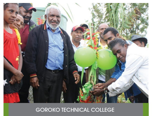
GOROKA TECHNICAL COLLEGE