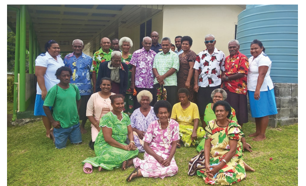
NAMARAI HEALTH CENTRE - Fiji