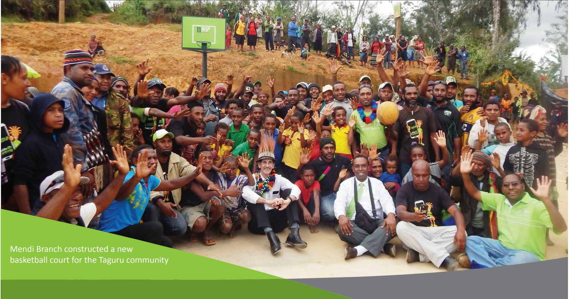
Mendi Branch constructed a new basketball court for the Taguru community

Our contribution to the Pacific is focused on delivering valuable and lasting changes for our people and the communities we operate in. In everything we do, we strive to be a good corporate citizen and to encourage community involvement through staff volunteering and lending a helping hand where and when we can.