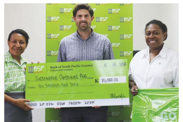
SUSTAINABLE COASTLINE PNG