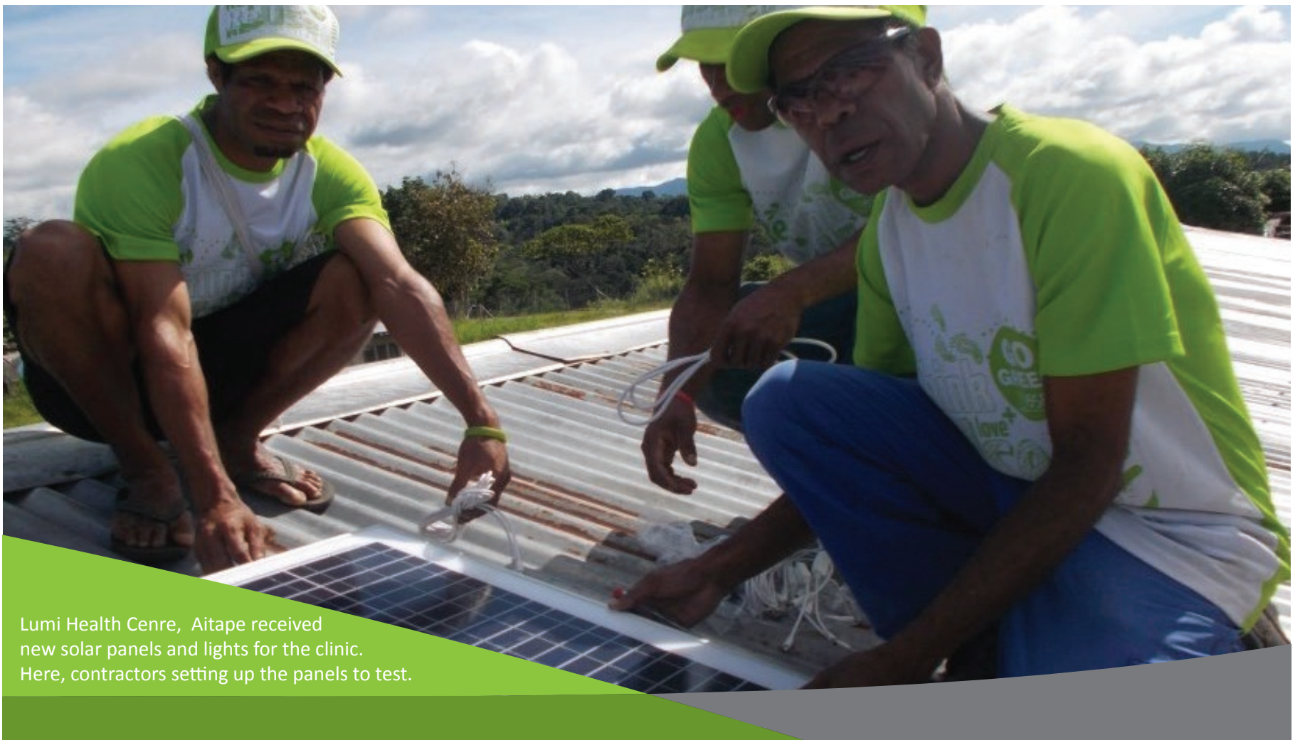
Lumi Health Centre, Aitape received new solar panels and lights for the clinic. Here, contractors setting up the panels to test.