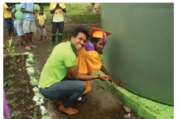
LAE MARKET - Gelam Musom Christian School