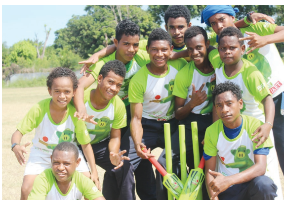
ST. THERESA U/15 BOYS