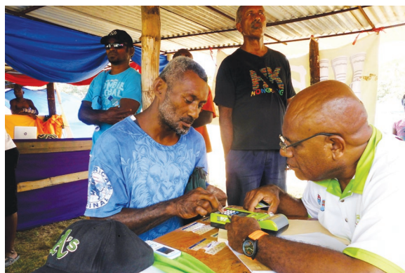
ACCOUNT OPENING - Fiji