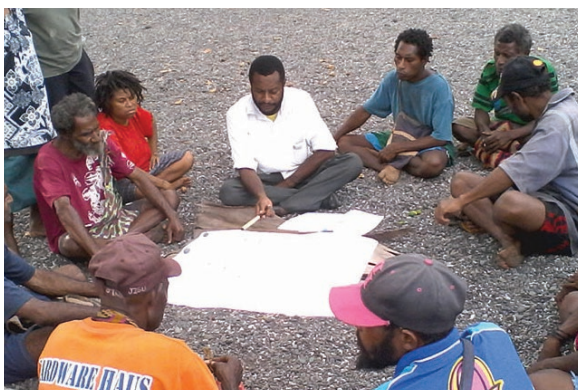
PARTICIPANTS IN DISCUSSION - PNG

BSP has 291 Agents in communities PNG wide, providing basic banking closer to home.