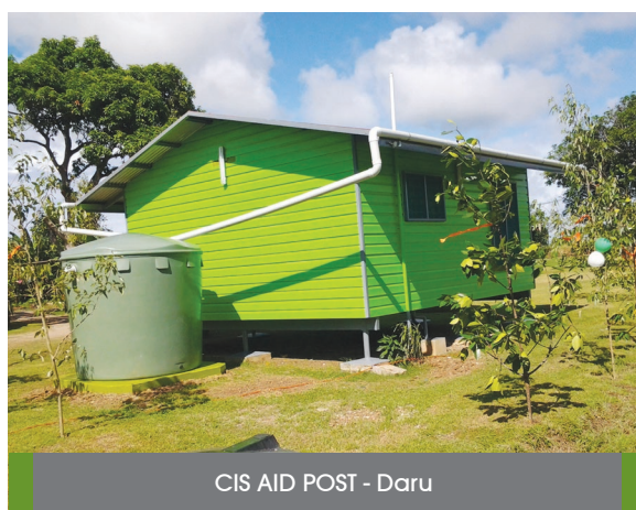
CIS AID POST - Daru