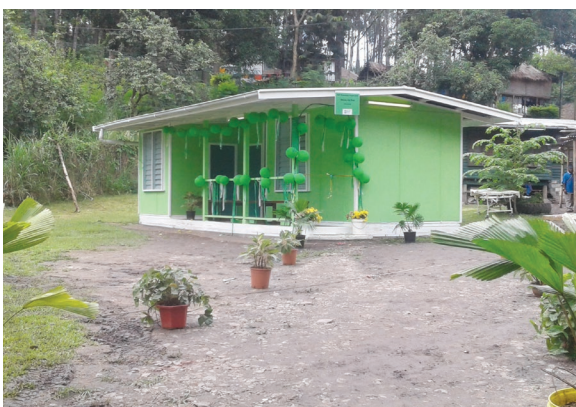
BAIUNE AID POST - Bulolo

Million Kina BSP has invested in community project throughout PNG since 2009. BSP fully funds these projects focusing on Education, Health, Sports and Environment.