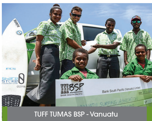
TUFF TUMAS BSP - Vanuatu

Quick fact: BSP acquired Westpac Operations in Vanuatu in July 2016.