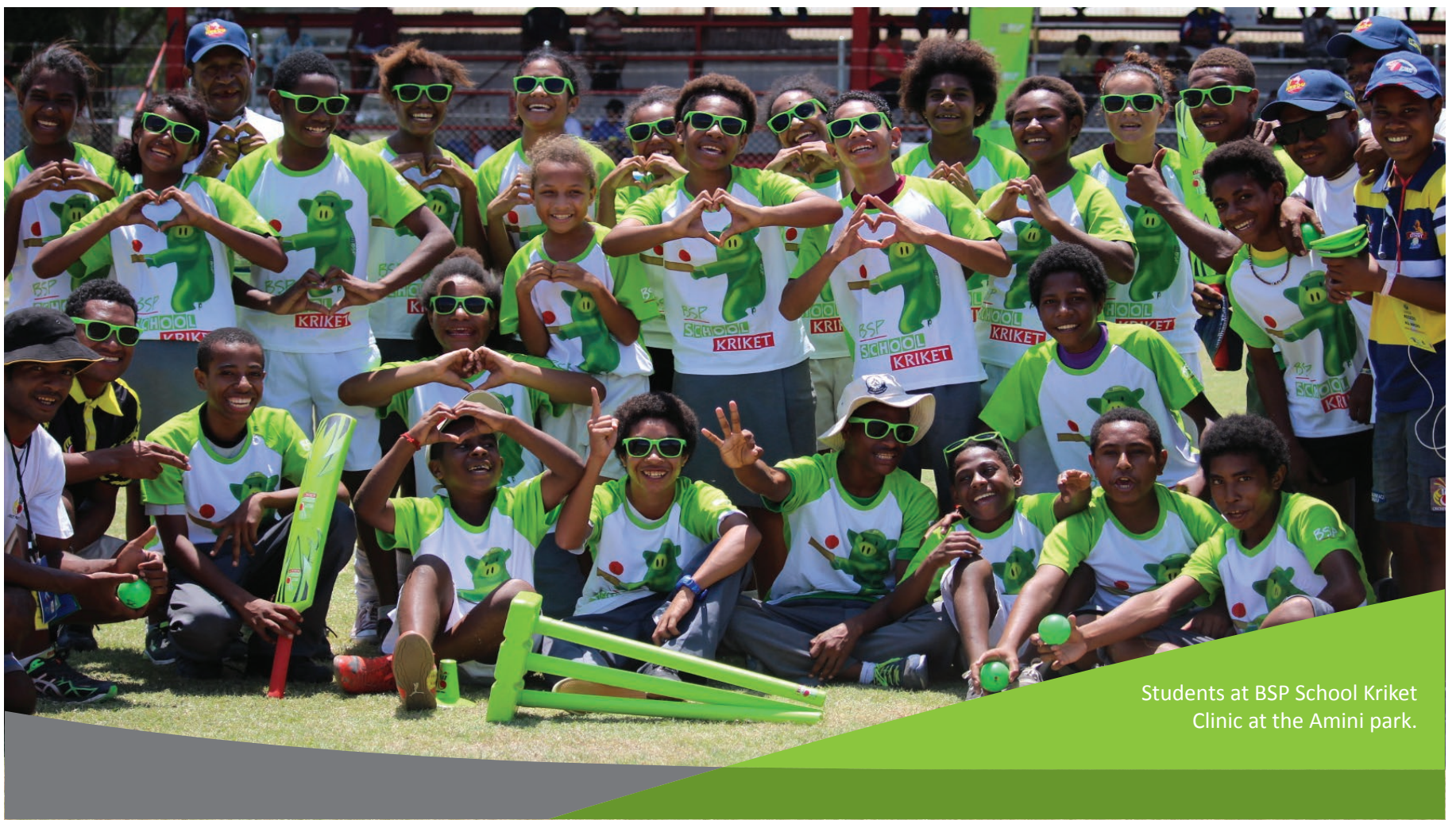
Students at BSP School Kriket Clinic at the Amini park.