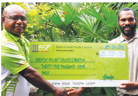
SEPIK RIVER CROCODILE FESTIVAL