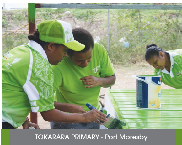
TOKARARA PRIMARY - Port Moresby