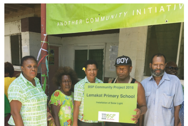
LEMAKOT - Kavieng