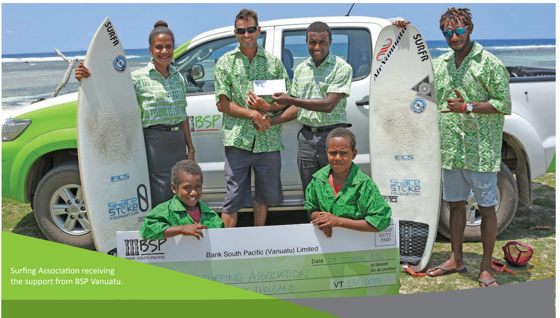
Surfing Association receiving the support from BSP Vanuatu.

As part of our ongoing commitment to strengthen community relationships, we support organisations by providing donations in cash and kind to support worthy causes.