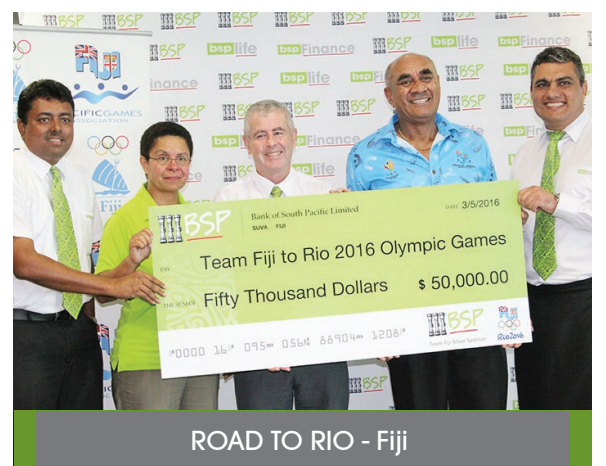
ROAD TO RIO - Fiji