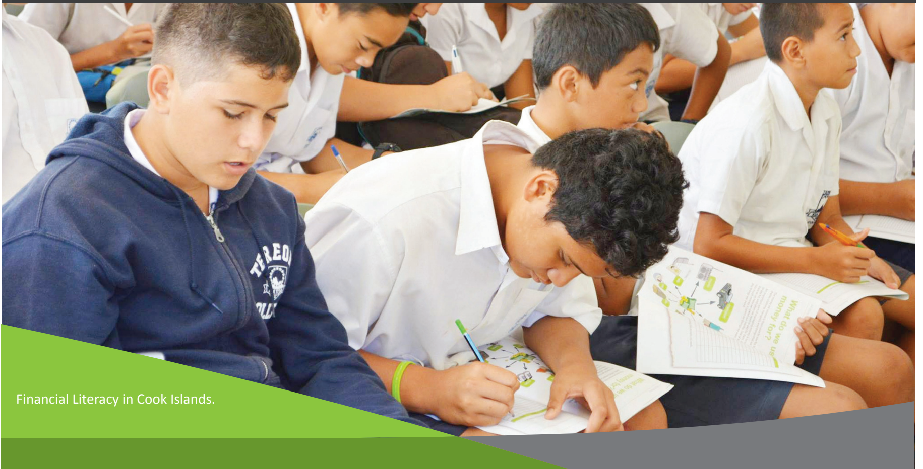
Financial Literacy in Cook Islands.

Financial education is key to self-sufficiency and peace of mind. At BSP, Banking Education and Financial Literacy is offered through each of our branches. We do this, because we believe that continual education of our customers and the community will contribute to the development of individuals.