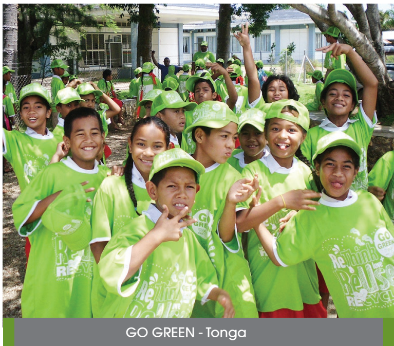
GO GREEN - Tonga