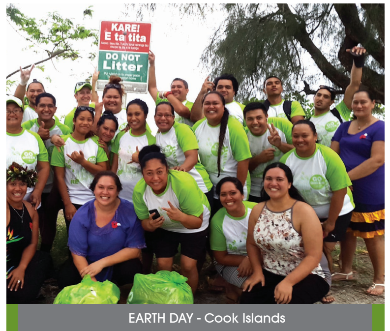
EARTH DAY - Cook Islands