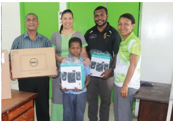
PNG BLIND SERVICE CENTRE - Port Moresby