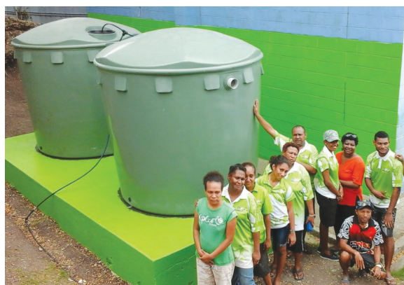
ST. MICHAELS PRIMARY - Port Moresby