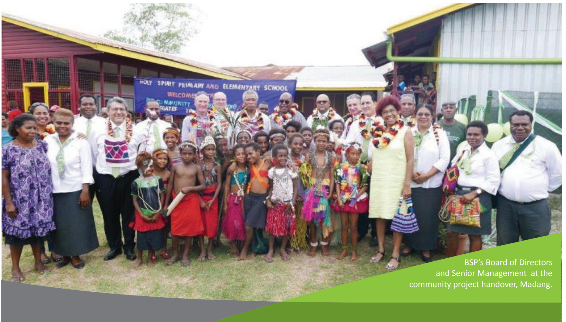
BSP's Board of Directors and Senior Management at the community project handover, Madang.

Our staff continue to deliver projects that are aimed to enrich communities and build unity. This is supported by the Board and Management. In Madang, Board Members took the opportunity to visit the Madang Holy Spirit Primary School to hand over new tanks that were installed by BSP Madang staff.