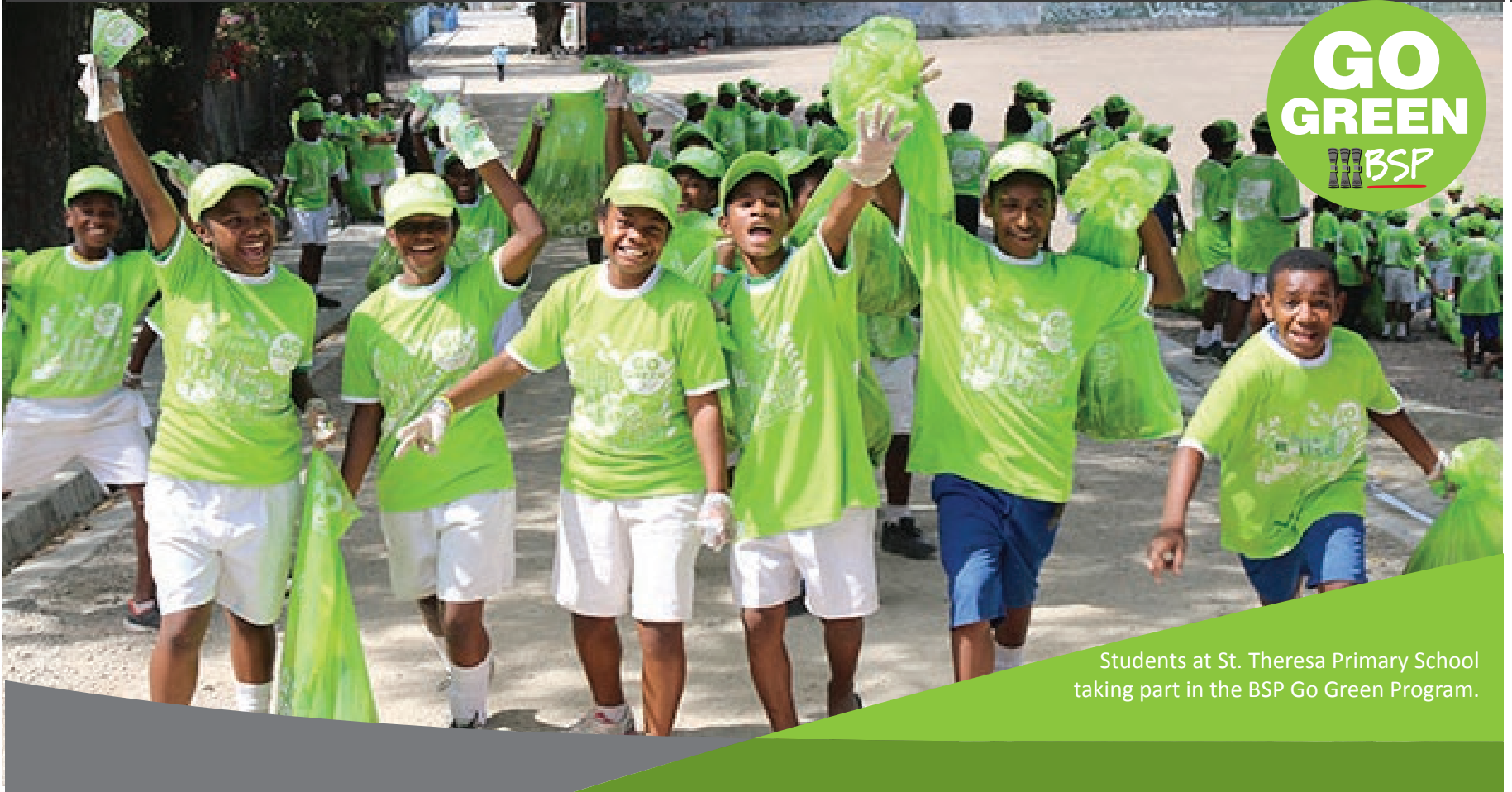
Students at St. Theresa Primary School taking part in the BSP Go Green Program.

At BSP, we care about promoting sustainable business practices while supporting economic growth in the countries we operate in. This is one of the reasons why we live to be the Greenest Bank in the Pacific. We embrace a balanced approach to business and to ensure that we educate our young generation to be mindful of litter and cleaning up our local environment.