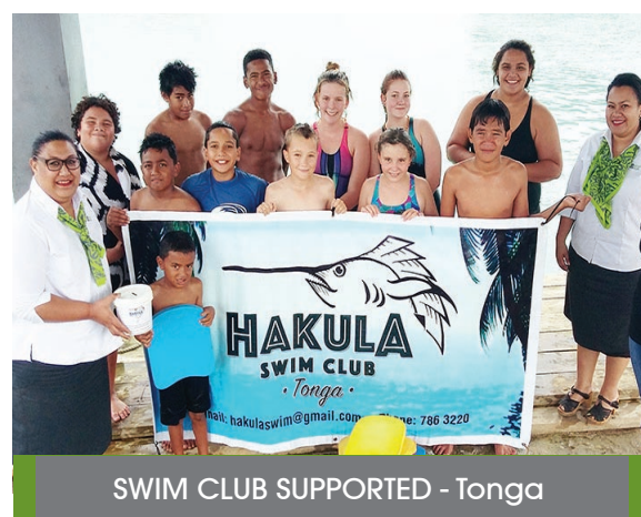
SWIM CLUB SUPPORTED - Tonga