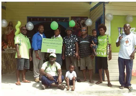
VANIMON - Waromo Catholic Church