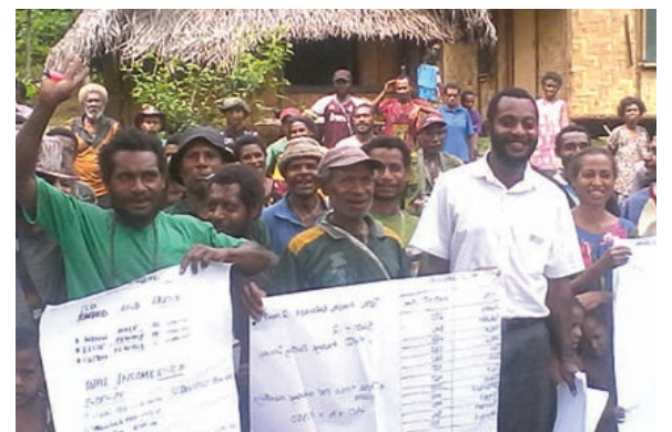
PARTICIPANTS PRESENTATION - PNG