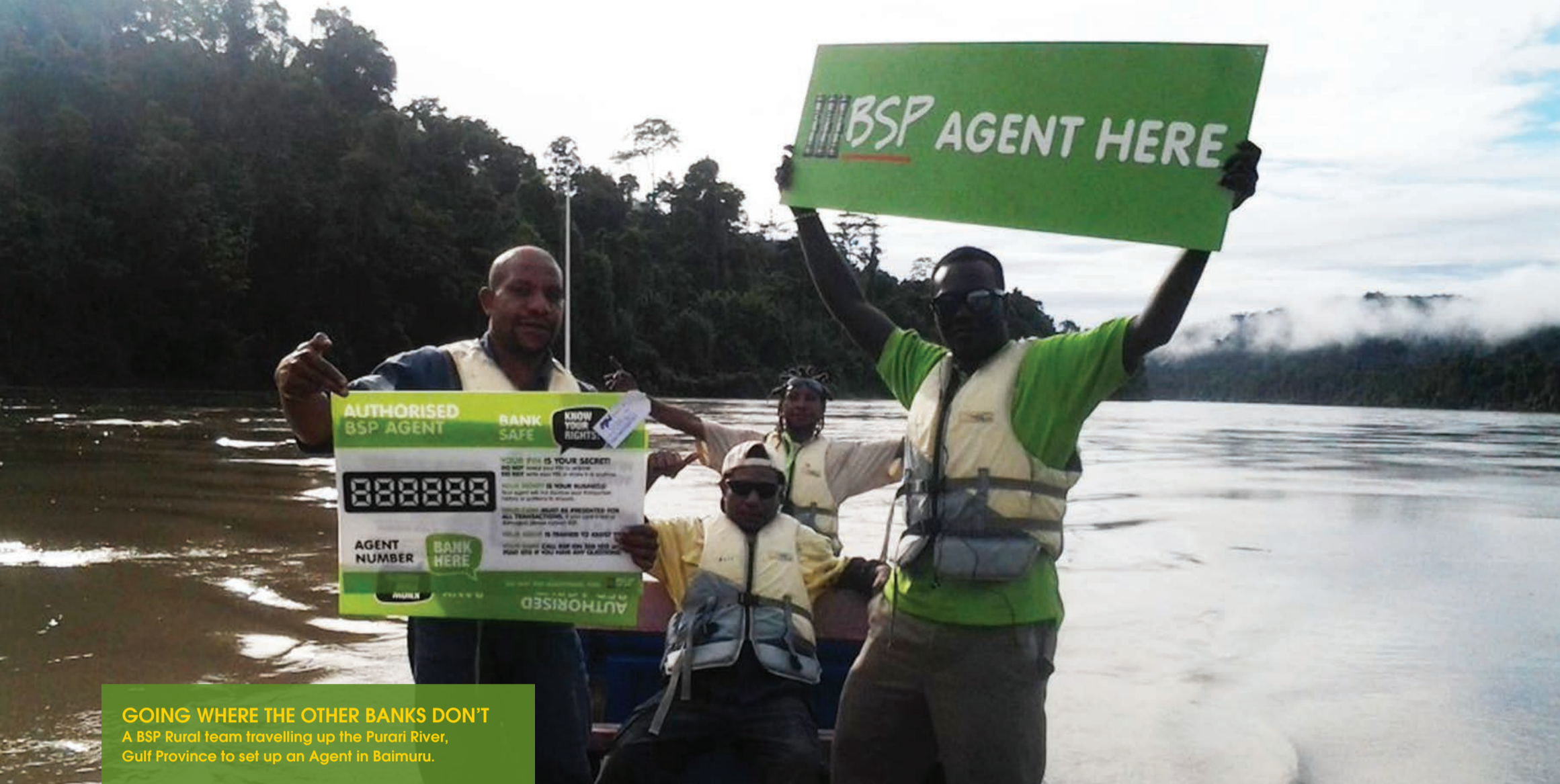
GOING WHERE THE OTHER BANKS DON'T A BSP Rural team travelling up the Purari River, Gulf Province to set up an Agent in Baimuru.