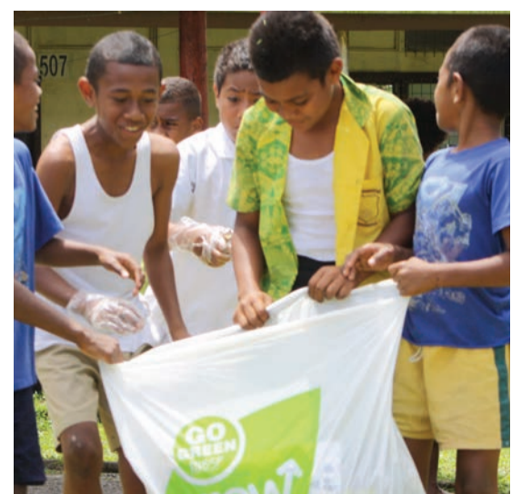
Go Green Fiji.