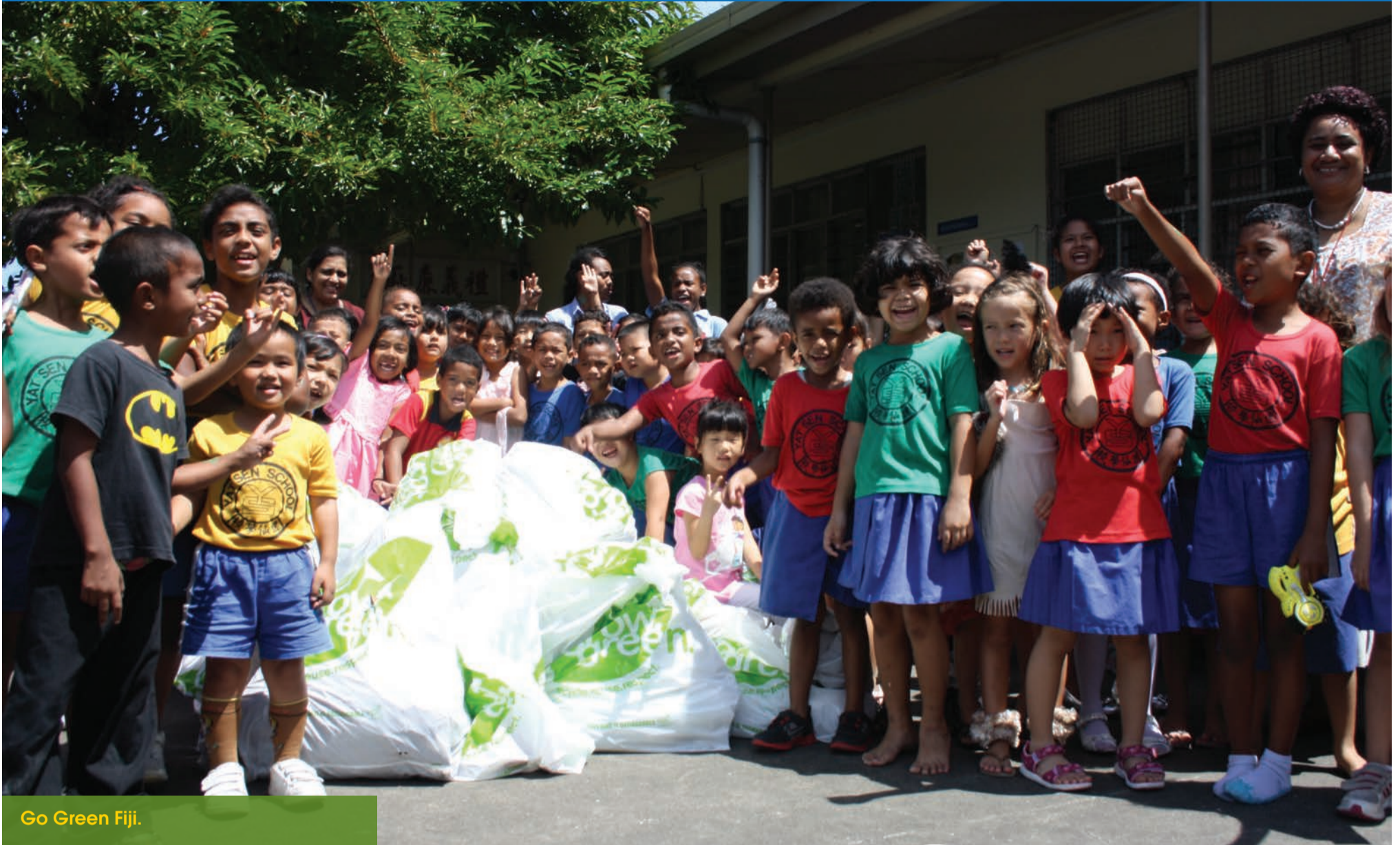
Go Green Fiji.