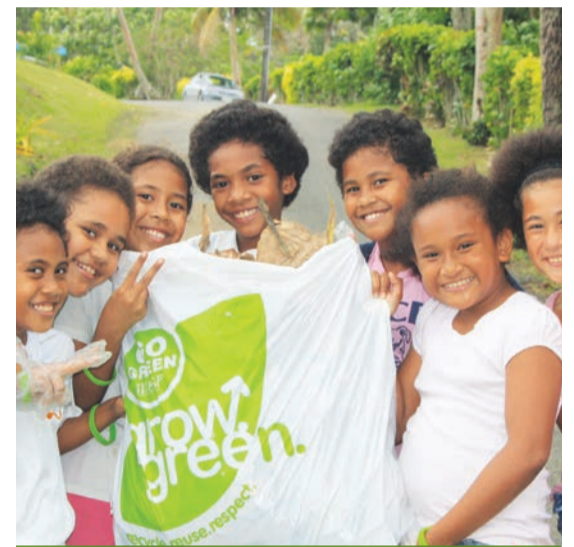
Go Green Fiji.

The Fijian public is educated on environmental issues and the aim this year was to evolve the campaign. This was specifically aimed at schools, inviting them to participate in an art competition where they would separate rubbish and create art from collected rubbish. This would encourage children to think about recycling and reusing their rubbish before disposing of it. The Go Green Campaign has been successful over the years with student participation numbers increasing from 14,000 in the first year to over 49,000 in 2013. Each year, BSP partners with the Ministry of Education, Department of Environment, Ministry of Local Government and the Municipal Councils. This year, the iTaukei Affairs Board were invited to be part of Go Green. 2013 was also the first time for a Go Green Art competition to be staged and it was a success.