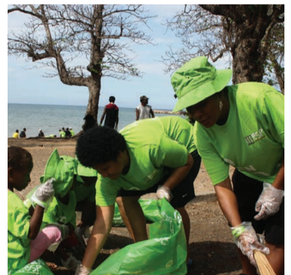
Go Green PNG