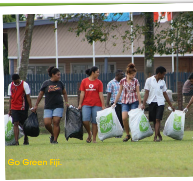
Go Green Fiji