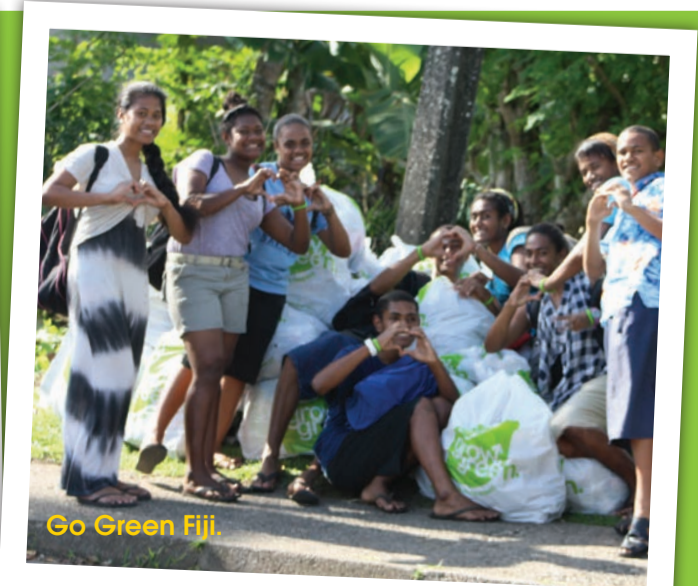
Go Green Fiji