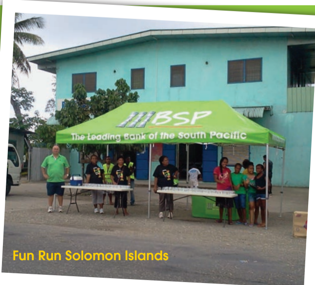
Fun Run Solomon Islands